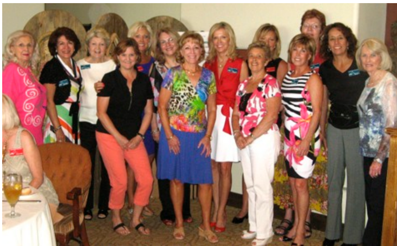
2013 - 2014 CWPP Board of Directors